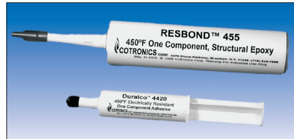
Single Component Adhesive in Ready to Use 4 oz. and 11 oz. Caulking Tubes